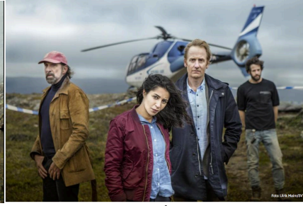
Midnatssol/Midnight Sun (Svt, NiceDrama, Canal+)