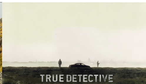
True Detective (HBO, Louisiana, US)