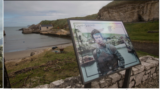
Games of Thrones (HBO, Ireland)