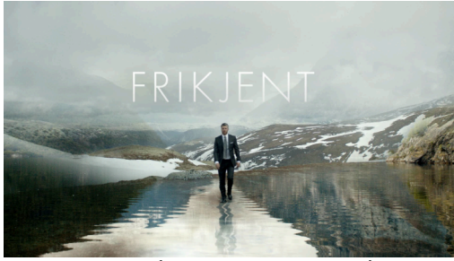
Frikjent/Acquitted (Tv2, MisoFilm Norway, N)