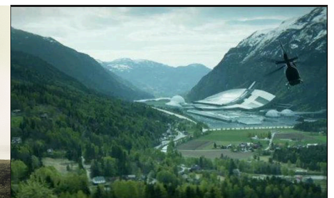
Okkupert/Occupied (TV2 Norway, YellowBird)